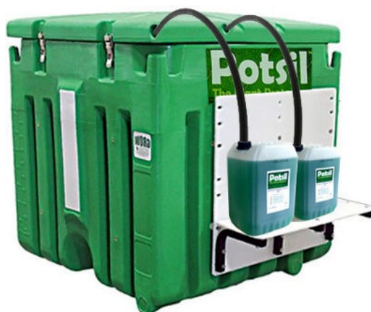
Figure 7: Autodosing Potsil into a hydroponic system.

Automated systems; Apply Potsil at 1.0-2.0mL per litre using a dedicated Dosatron/Solanoid. Study the effect of Potsil's alkalinity on your fertigation stream and adjust your acid solenoid in accordance.