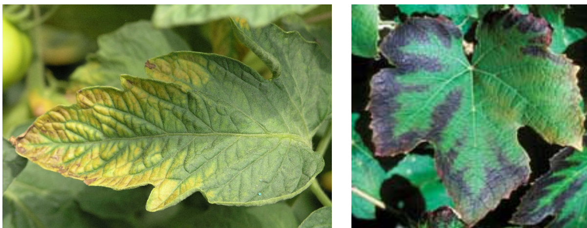
Figure 5; Classic symptoms of potassium deficiency in tomato (left) and grape (right).

Potassium (K) is an essential plant nutrient that is needed in plants for, amongst other things, flower formation and fruit set. This could explain why bananas are such a good source of this nutrient for human nutrition! Therefore, symptoms of potassium deficiency are often observed when plants come into flower and fruit. On the foliage of plants potassium deficiency manifests itself as a scorching (browning) and rolling inwards of the leaf margin (edge), especially on older leaves (figure 5). Symptoms can also include necrotic lesions and the death of leaves and buds. Potassium deficient plants have also been found to be more susceptible to heat stress in hot weather. Unfortunately, for many plants a deficiency of potassium is often symptomless and farmers can suffer losses in yield due to potassium deficiency despite their plants looking perfectly healthy. As a result, potassium deficiency is often referred to as 'hidden hunger'.