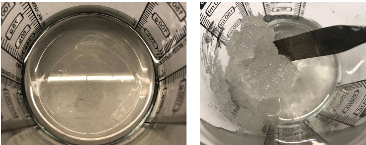
Figure 6: Left = Potsil's silicon component as a fully soluble liquid (minus multifunctional additives and natural pigment). Right = When phosphoric acid is added to the solution an insoluble gel has formed which will permanently lock up the silicon nutrient and can block filters, pipes and spray nozzles.

Consider your overall potassium levels. Potsil contains significant levels of potassium and as such, this should be considered as part of your overall nutrient management program.