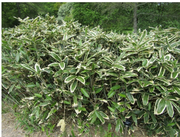
Figure 1: the bamboo Sasa veitchii ; 41% \text{SiO}_2 by dry weight.

Monocot plants can accumulate extremely high concentrations in their tissues. For example, the bamboo Sasa veitchii (figure 1) in which an astonishing 41% of the dry weight is silica ( \text{SiO}_2 ). As the absorption of silicon into plants is an active controlled process (not passive diffusion), the plant would not absorb and deposit such massive levels of silicon unless it was performing major beneficial functions.