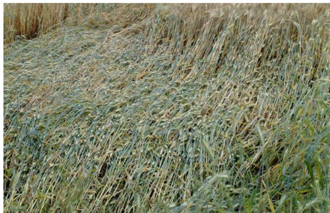
Figure 3: A wheat crop that has lodged following heavy rain and wind. The mechanical strength provided by adequate silicon nutrition can help prevent such losses of crops.

The silica that is deposited in the walls of the cells in the foliage and stems contribute significantly to their mechanical strength and rigidity and supplying supplemental silicon in the fertigation stream has been shown in multiple independent studies to enhance the strength and rigidity of cell walls. Stronger cell walls are important as they contribute to resisting lodging in cereal crops in windy conditions (figure 3). In addition, enhanced leaf thickness, erectness, and rigidity improves the exposure of leaves to light; an effect that has been shown to increase in relation to the amount of silicon delivered.